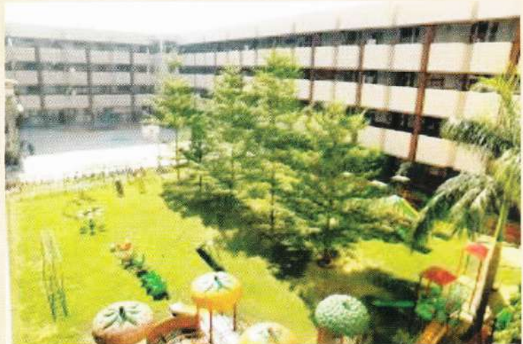
View of the School