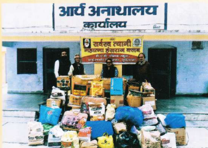
Utility and daily needs for the orphanage.